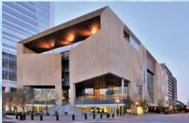
museum / cinemas