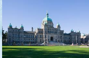
parliaments / castles