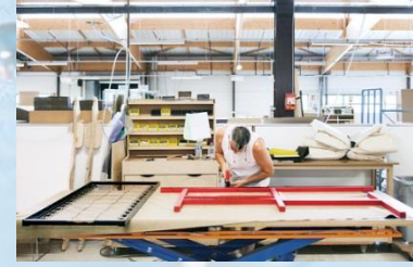
Shoes / furniture manufacturing